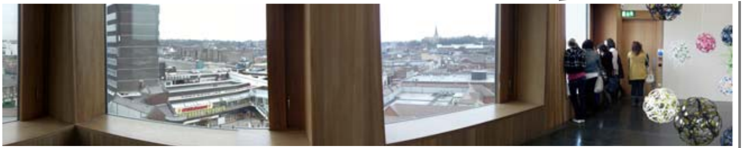
AS Art and Design students admiring the view across Walsall from the top floor of the gallery